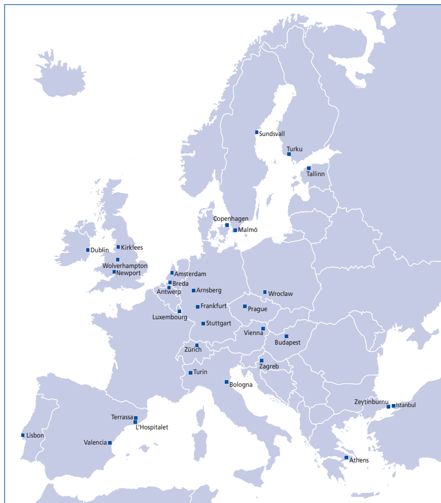
Figure 1: CLIP cities covered in this report