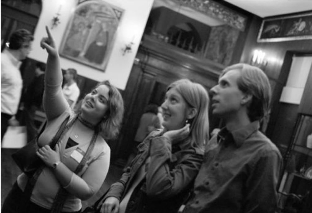
Figure 6. Gardner After Hours