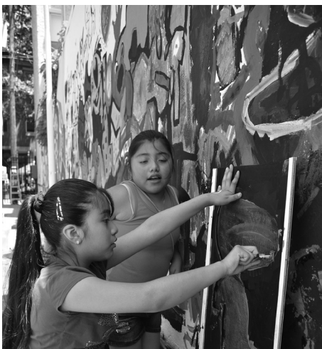
Figure 7. Fleisher Art Memorial's ColorWheels and ARTspiration! Festival