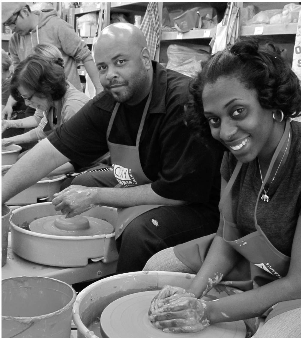
Figure 1. Clay Studio Workshop Targeting Young Adults