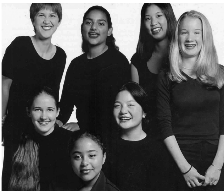
Figure 5. SFGC Images Presented to Focus Group Respondents